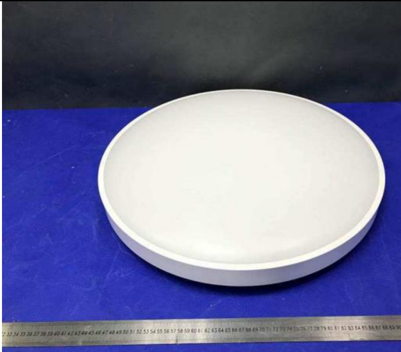
Overview for YLXD013-A