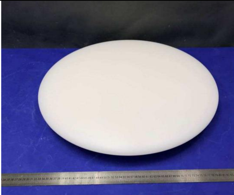
Overview for YLXD013-C