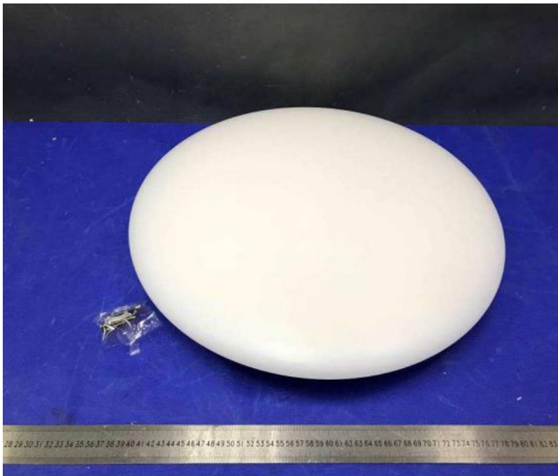
Overview for YLXD013-B